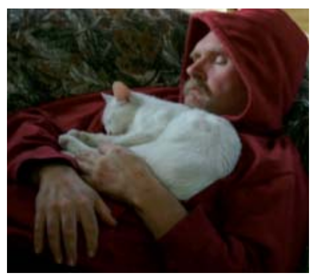
Jedi and Master Napping [See page 3]

Faculty and Staff members move on to other ventures and new members come in to carry on our service to the members of STARFLEET. Others have left for the Final Frontier, but dedicated STARFLEET members have stepped in to fill those vacancies. [See page 8 for more]