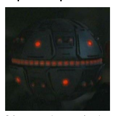
Subspace anti-personnel mine, known as "Houdinis".

Nicknamed "Houdinis" by the SFMC and Starfleet troops who have encountered them, these are a type of anti-personnel mine employed by the Jem'Hadar. These mines are unique in that once deployed they hide in small pockets of subspace only emerging into normal space to detonate. These mines can not be detected by normal tricorder scans and they can be dispersed at any height. Jem'Hadar usually deploy these mines in high value areas and have them hover at chest or head height. The fact that sensor scans can not detect them coupled with the method of deployment decimated any troops that encountered them.