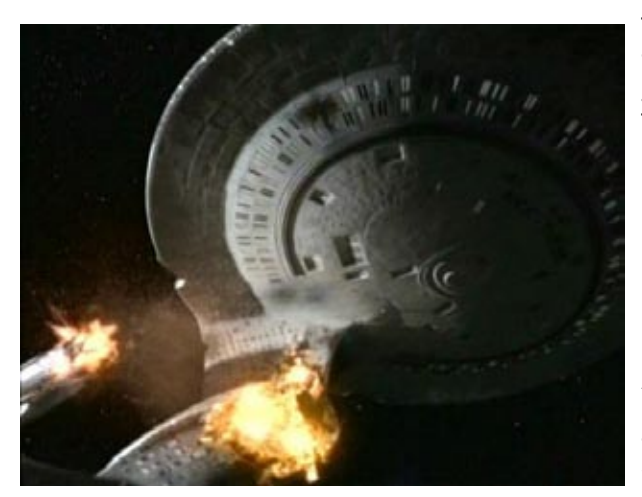
The USS Odyssey is destroyed by a Jem'Hadar attack.

The Jem'Hadar are fierce warriors and are known for the destruction that they bring when they wage war, leaving desolated planets in their wake. But for those that are not utterly destroyed, the Jem'Hadar makes examples of them and uses biological weapons designed to cause slow and painful deaths. For this they are universally feared throughout The Dominion.